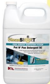
Product No. 1115