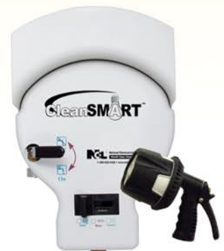
Product No. 4119