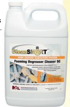
Product No. 1117