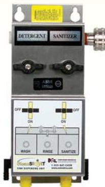
Product No. 4118