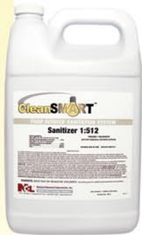
Product No. 1116